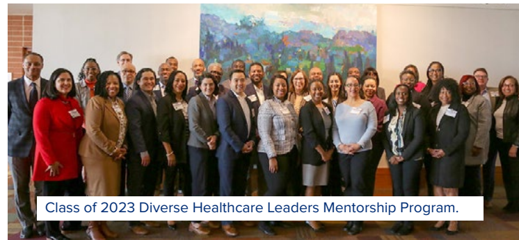
Class of 2023 Diverse Healthcare Leaders Mentorship Program.

The Equity of Care Delivery Dashboard is now available to all members who have signed the Equity Resolution. The password-protected Dashboard illustrates each participating member's performance in the initial quality metrics measured by race/ethnicity: readmissions for patients with cardiovascular disease, readmissions for diabetic patients, rates of postpartum hemorrhage, and patient satisfaction. Each participating member can now assign up to five colleagues within their institution to have access to the Dashboard and related reports. Recommended users should be part of the executive team or hold a leadership role to advance equity, familiar with your hospital or health system's data, or work in the areas of performance or quality improvement. If you have any questions, please email equity@ncha.org .