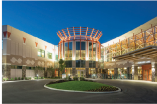
The $82 million investment in the Cherokee Indian Hospital which opened in 2015.

Examples of recent capital investments include: