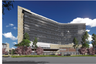
The $235 million investment in the North Carolina Heart & Vascular Hospital at UNC Rex Healthcare in Raleigh which opened in 2017.