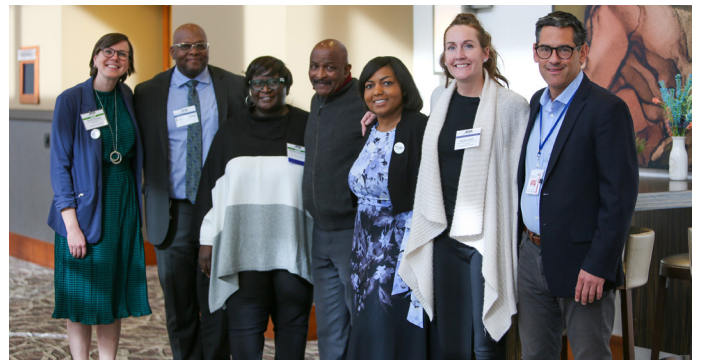
NCHF and NC Office of Rural Health teams convened critical access hospitals in February.

Participants gain clinical coaching, leadership skills, and mentorship that connects quality goals to measurable improvements. Capstone projects have enhanced safety, care, satisfaction—and, in many cases, financial performance. In May, NCHF celebrated its largest graduating class. Among certification seekers, 92% passed the CPHQ exam—well above the national average.