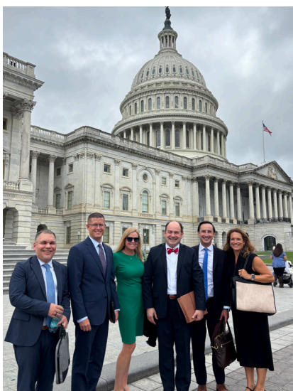
The NCHA Advocacy team along with hospital and health system Government Relations Officers in Washington, DC to lobby Congress.

Given the significant healthcare discussion at the federal level, NCHA and its members' top priority is to protect Medicaid and the many individuals who count on Medicaid coverage for their care. The impact to Medicaid cuts doesn't stop there — our hospitals rely on a strong Medicaid program, including North Carolina's Healthcare Access and Stabilization Program (HASP), to keep their doors open for all who need hospital care.